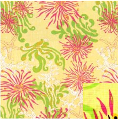
Bimini in Dandelion 2011100-407

This signature touch, which also appears in the fashion line, is the hallmark of an authentic Lilly Pulitzer-designed fabric. This little detail, a tradition for decades of prints, brings the brand to life in a truly original way.