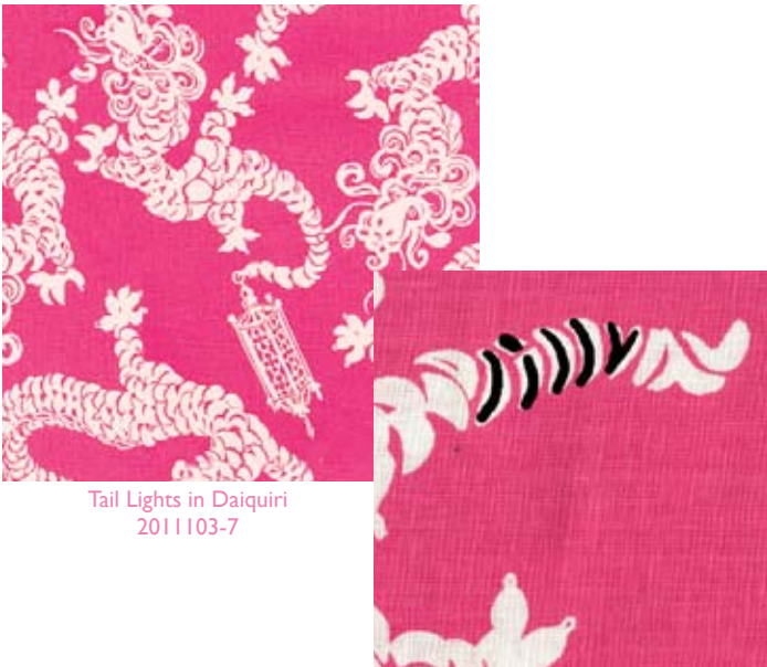
Tail Lights in Daiquiri 2011103-7