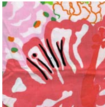
Heritage Floral in Multi 2011106-573