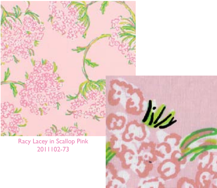
Racy Lacey in Scallop Pink 2011102-73