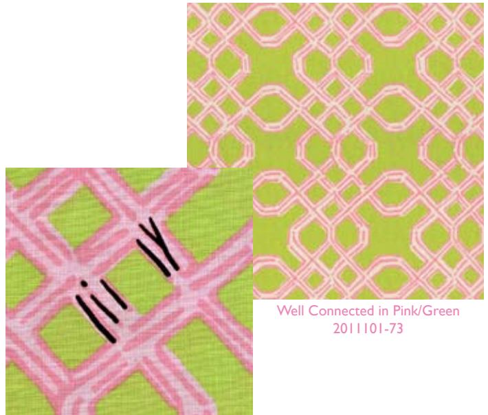
Well Connected in Pink/Green 2011101-73