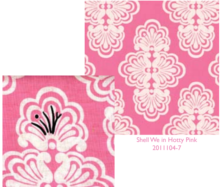
Shell We in Hotty Pink 2011104-7