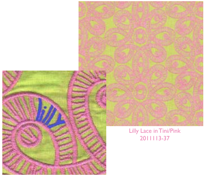
Lilly Lace in Tini/Pink 2011113-37